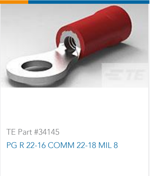
TE Part #34145 PG R 22-16 COMM 22-18 MIL 8