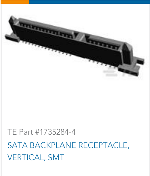
TE Part #1735284-4 SATA BACKPLANE RECEPTACLE, VERTICAL, SMT