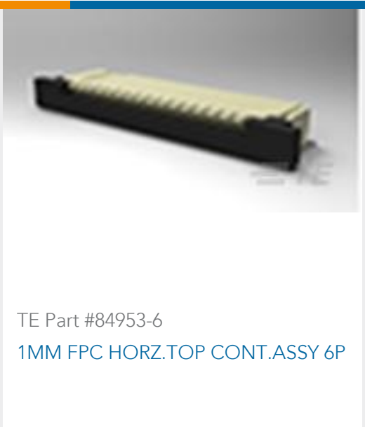
TE Part #84953-6 1MM FPC HORZ.TOP CONT.ASSY 6P