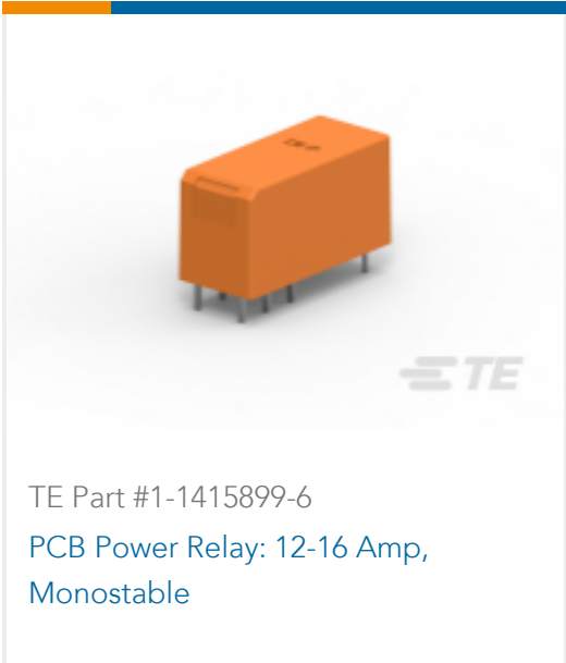
TE Part #1-1415899-6 PCB Power Relay: 12-16 Amp, Monostable