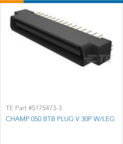
TE Part #5175473-3 CHAMP 050 BTB PLUG V 30P W/LEG