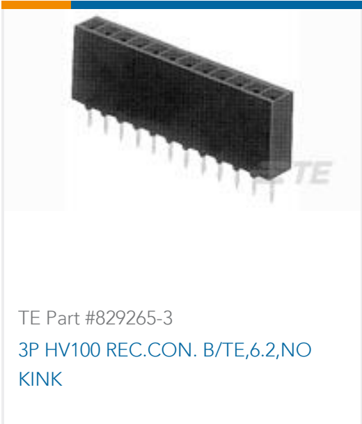
TE Part #829265-3 3P HV100 REC.CON. B/TE,6.2,NO KINK