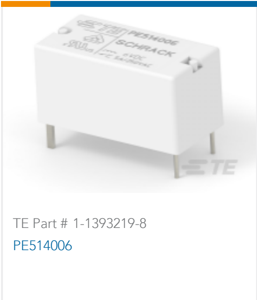
TE Part # 1-1393219-8 PE514006