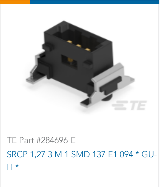
TE Part #284696-E SRCP 1,27 3 M 1 SMD 137 E1 094 * GU-H *