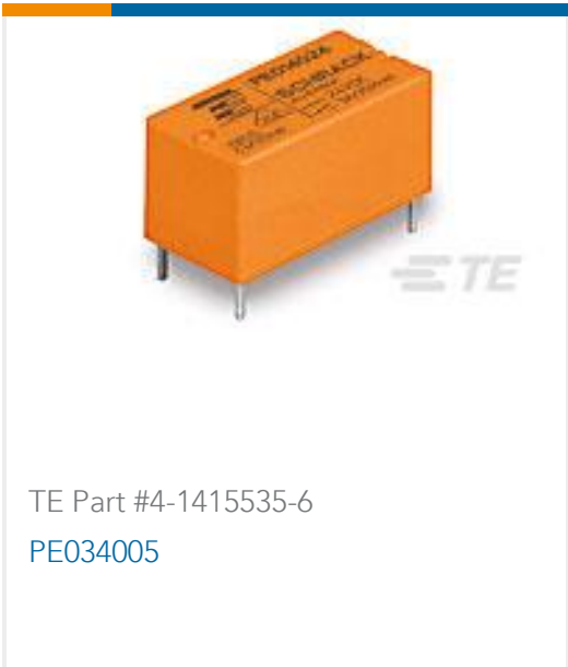
TE Part #4-1415535-6 PE034005