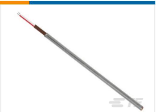
TE Part #R-10318-69 TC,BRG,IS,T,STD,U,.188D