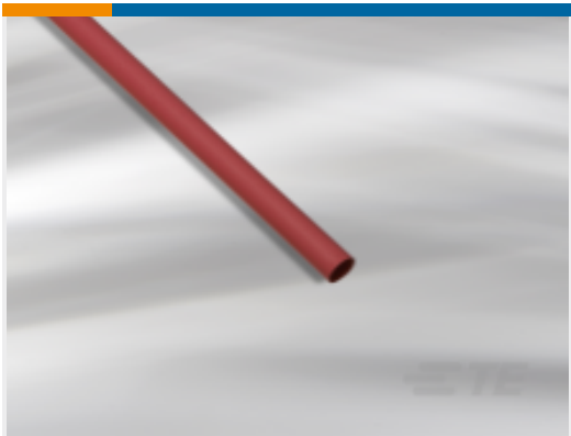
TE Part #NB07086001 BATTU-12.7/6.1-A1-2-32MM