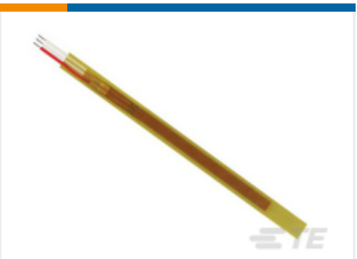
TE Part #R-8203 RTD,STRR,C10,427,.5%,.030T,H