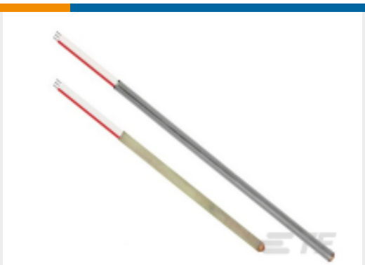
TE Part #R-8580-362 RTD,BRG,SS,P100,385,.12%,.250D