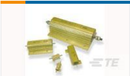
TE Part #2-1676625-4 HSA25 34R 5%