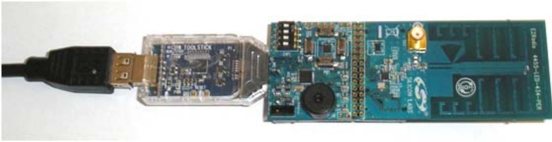
Figure 2. How to Connect the RFStick to the PC

The power source of the board can be selected with the power-supply selector switch (S6). If S6 is in the Adapter position, supply voltage is provided by a Toolstick Base Adapter that is connected to the J1 PCB edge connector. If S6 is in the Battery position, the supply voltage is provided by two AAA batteries in the battery holder on the bottom side of the board. Current consumption of the RF part (RFVDD) can be measured on J6. Since J6 is shorted by a PCB track on the bottom side of the board, the user must cut the track if this feature is used.