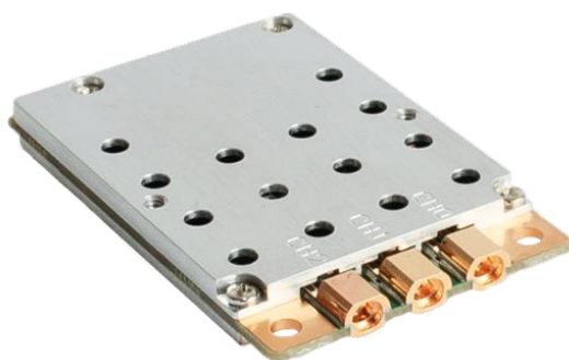
Figure 1. Top and bottom views of the NM-DB-3M transceiver with MMCX connectors.

Doodle Labs' portfolio of Industrial Wi-Fi transceivers offer the industry's best-in-class performance. These transceivers have high transmit power to achieve long range and offer the rugged construction to withstand operation in the extended temperature range. In addition, our transceivers feature high interference immunity that allows successful operation in today's congested Wi-Fi environments. The transceivers are FCC, CE, and IC certified and have been deployed in numerous demanding applications.