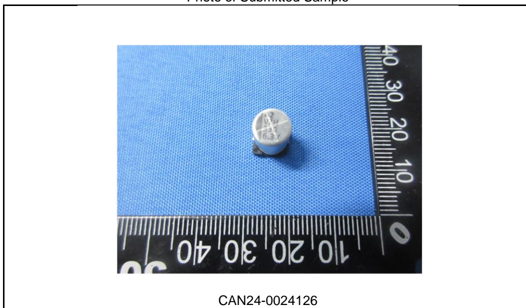
Photo of Submitted Sample

SGS authenticate the photo on original report only