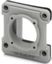
RJ45 panel mounting frame, IP67, for modular socket inserts (Keystone), for square panel cutout, with grommet, without mounting screws, color: gray

Please be informed that the data shown in this PDF Document is generated from our Online Catalog. Please find the complete data in the user's documentation. Our General Terms of Use for Downloads are valid ( http://phoenixcontact.com/download )