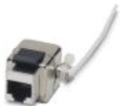
RJ45 socket insert, modular (Keystone), CAT5e, 8-pos., shielded, with cable connection (LSA), for solid wires AWG 26 ... 22

RJ45 socket insert - VS-08-BU-RJ45/KA/LSA - 1689459