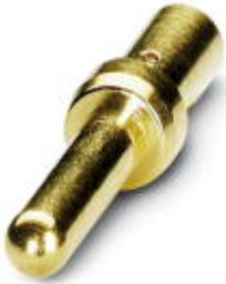
Crimp contact, turned, contact diameter: 2 mm, crimp range: 0.5 mm 2 ... 0.75 mm 2

Please be informed that the data shown in this PDF Document is generated from our Online Catalog. Please find the complete data in the user's documentation. Our General Terms of Use for Downloads are valid ( http://phoenixcontact.com/download )