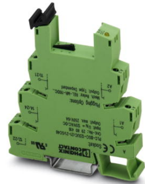
Figure shows PLC-BSC-120UC/21-21/SO46 version

http://catalog.phoenixcontact.net/phoenix/treeViewClick.do?UID=2967772