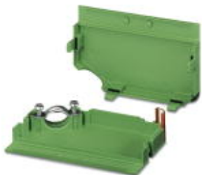
Cable housing, pitch: 0 mm, number of positions: 9, dimension a: 45 mm, color: green

Please be informed that the data shown in this PDF Document is generated from our Online Catalog. Please find the complete data in the user's documentation. Our General Terms of Use for Downloads are valid ( http://phoenixcontact.com/download )