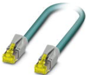
Patch cable, degree of protection: IP20, number of positions: 8, 10 Gbps, CAT6 A

Please be informed that the data shown in this PDF Document is generated from our Online Catalog. Please find the complete data in the user's documentation. Our General Terms of Use for Downloads are valid ( http://phoenixcontact.com/download )