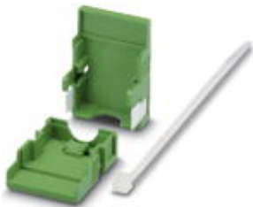
Cable housing, pitch: 3.81 mm, number of positions: 4, dimension a: 17.63 mm, color: green

Please be informed that the data shown in this PDF Document is generated from our Online Catalog. Please find the complete data in the user's documentation. Our General Terms of Use for Downloads are valid ( http://phoenixcontact.com/download )