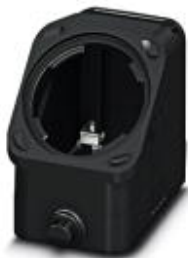
HEAVYCON EVO sleeve housing, plastic, with bayonet flange for EVO screw connection, B10, for single locking latch, height: 60.5 mm, without EVO screw connection

Please be informed that the data shown in this PDF Document is generated from our Online Catalog. Please find the complete data in the user's documentation. Our General Terms of Use for Downloads are valid ( http://phoenixcontact.com/download )