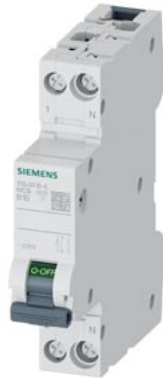
CIRCUIT BREAKER 230V 6KA, 1+N-POLE/1MW B10