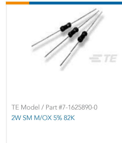
TE Model / Part #7-1625890-0 2W SM M/OX 5% 82K