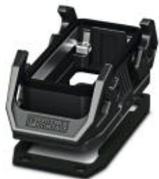
HEAVYCON EVO panel mounting base, plastic, B16, with double locking latch, height: 30.5 mm, with flat gasket

Please be informed that the data shown in this PDF Document is generated from our Online Catalog. Please find the complete data in the user's documentation. Our General Terms of Use for Downloads are valid ( http://phoenixcontact.com/download )