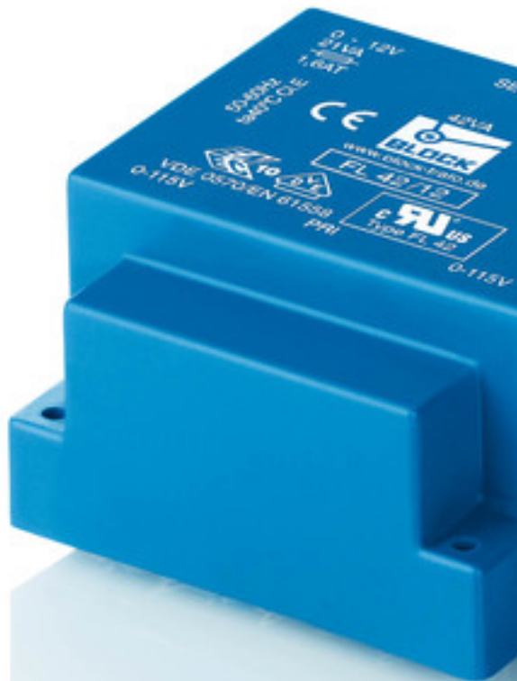
Picture shows FL 42/12