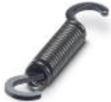
Spare recuperating spring

Replacement spring - CRIMPFOX/ SPR-3 - 1212036