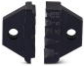
Spare die for CRIMPFOX 6

Replacement die - CRIMPFOX 6/DIE - 1212035