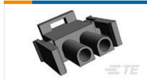
TE Part # 1-480698-0 02P UMNL PLUG HSG NATL