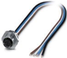
Flush-type connector, Universal, 5-position, Socket, M12, A-coded, Front mounting, M16 x 1.5, Individual wires, cable length: 0.5 m

Please be informed that the data shown in this PDF Document is generated from our Online Catalog. Please find the complete data in the user's documentation. Our General Terms of Use for Downloads are valid ( http://phoenixcontact.com/download )