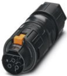
PRC test plug, black, 3-pos., 1.5 mm² ... 6 mm²/630 V/35 A, with screw connection, for cables with a diameter of 8 mm ... 21 mm.

Please be informed that the data shown in this PDF Document is generated from our Online Catalog. Please find the complete data in the user's documentation. Our General Terms of Use for Downloads are valid ( http://phoenixcontact.com/download )