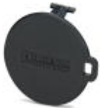
Protective cap for 3 and 5-pos. PRC field plugs