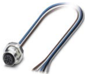
Sensor/actuator flush-type socket, 5-pos., M12, A-coded, rear/screw mounting with Pg9 thread, with 0.5 m TPE litz wire, 5 x 0.34 mm 2 , stainless steel version

Please be informed that the data shown in this PDF Document is generated from our Online Catalog. Please find the complete data in the user's documentation. Our General Terms of Use for Downloads are valid ( http://phoenixcontact.com/download )