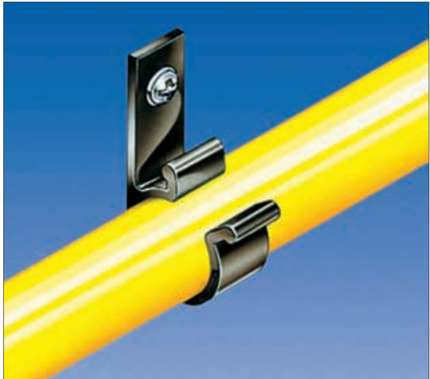
The clip is held in place by a screw and the bundled cable or pipe is guided securely.

Screwed D-clips are available in 3 sizes and guarantee time and cost saving by simply pressing the cable into the holder. The flexible grip means that later removal or replacement of cables and pipes is possible. 3 different bore diameters for fixing the holder are available