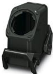
HEAVYCON EVO sleeve housing, plastic, with bayonet flange for EVO screw connection, B16, with double locking latch, height: 78 mm, without EVO screw connection

Please be informed that the data shown in this PDF Document is generated from our Online Catalog. Please find the complete data in the user's documentation. Our General Terms of Use for Downloads are valid ( http://phoenixcontact.com/download )