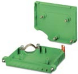
Cable housing, pitch: 0 mm, number of positions: 9, dimension a: 70.98 mm, color: green

Please be informed that the data shown in this PDF Document is generated from our Online Catalog. Please find the complete data in the user's documentation. Our General Terms of Use for Downloads are valid ( http://phoenixcontact.com/download )