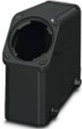
HEAVYCON EVO sleeve housing, plastic, with bayonet flange for EVO screw connection, B24, for double locking latch, height: 87.5 mm, without EVO screw connection

Please be informed that the data shown in this PDF Document is generated from our Online Catalog. Please find the complete data in the user's documentation. Our General Terms of Use for Downloads are valid ( http://phoenixcontact.com/download )