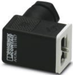
Valve connector, 4-pos., type C, unconnected, screw connection, cable screw connection Pg7

Please be informed that the data shown in this PDF Document is generated from our Online Catalog. Please find the complete data in the user's documentation. Our General Terms of Use for Downloads are valid ( http://phoenixcontact.com/download )