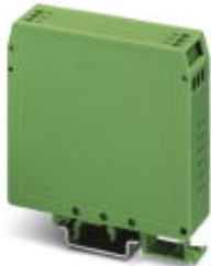
Electronic housing, for PCB insertion, fully equipped with 3 screw or 6 tab connections per side

Please be informed that the data shown in this PDF Document is generated from our Online Catalog. Please find the complete data in the user's documentation. Our General Terms of Use for Downloads are valid ( http://phoenixcontact.com/download )