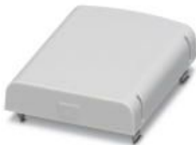
DIN rail housing, Cover, width: 39.7 mm, height: 51.8 mm, depth: 13.7 mm, color: light gray (7035)

Please be informed that the data shown in this PDF Document is generated from our Online Catalog. Please find the complete data in the user's documentation. Our General Terms of Use for Downloads are valid ( http://phoenixcontact.com/download )