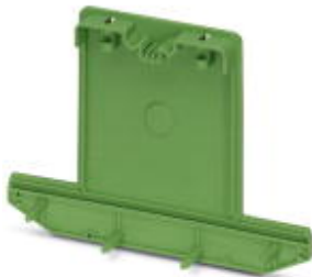
Side element, tall version, for closing both ends of the base element UM-BEFE, for 60 mm wide U-shaped profile cover

Please be informed that the data shown in this PDF Document is generated from our Online Catalog. Please find the complete data in the user's documentation. Our General Terms of Use for Downloads are valid ( http://phoenixcontact.com/download )