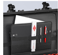
With document compartment