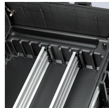
Aluminium separators for individually dividing up the base tray