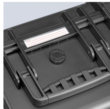
With pressure valve for venting and name plate