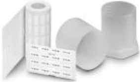
The figure shows the EML (20X8)R product variant

Label, Roll, silver/matt, unlabeled, can be labeled with: THERMOMARK ROLL, THERMOMARK X, THERMOMARK S1.1, Mounting type: Adhesive, Lettering field: 110 x 40000 mm