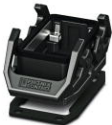
HEAVYCON EVO panel mounting base, plastic, B10, with double locking latch, height: 30.5 mm, with flat gasket

Please be informed that the data shown in this PDF Document is generated from our Online Catalog. Please find the complete data in the user's documentation. Our General Terms of Use for Downloads are valid ( http://phoenixcontact.com/download )