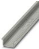
DIN rail, unperforated, Standard profile 2.3 mm, width: 35 mm, height: 15 mm, acc. to EN 60715, material: Steel, galvanized, passivated with a thick layer, length: 2000 mm, color: silver

DIN rail, unperforated - NS 35/15-2,3 UNPERF 2000MM - 1201798