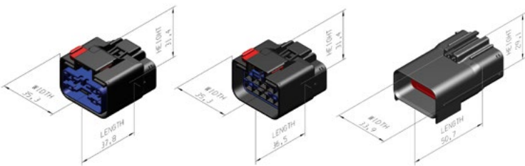
APEX® 2.8 Unsealed 10W Female pre-assembly