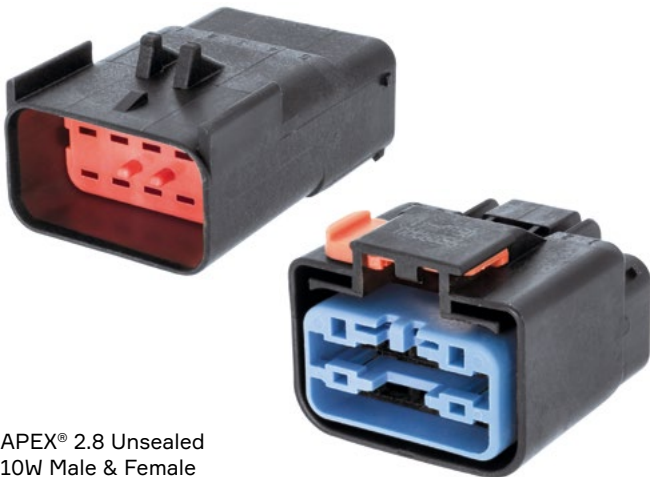
APEX ® 2.8 Unsealed 10W Male & Female