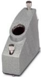
Powder-coated sleeve housing, with metric cable entry, locking screws with knurled head

Please be informed that the data shown in this PDF Document is generated from our Online Catalog. Please find the complete data in the user's documentation. Our General Terms of Use for Downloads are valid ( http://phoenixcontact.com/download )