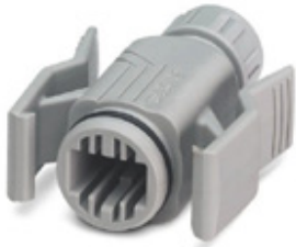
RJ45 sleeve housing, IP67, for pin insert VS-08-ST-RJ45, with push-pull interlocking for panel mounting frames, for cable cross section 5.0 mm ... 6.5 mm

Please be informed that the data shown in this PDF Document is generated from our Online Catalog. Please find the complete data in the user's documentation. Our General Terms of Use for Downloads are valid ( http://phoenixcontact.com/download )