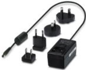
Power supply unit for operating the THERMOFOX printer

Please be informed that the data shown in this PDF Document is generated from our Online Catalog. Please find the complete data in the user's documentation. Our General Terms of Use for Downloads are valid ( http://phoenixcontact.com/download )