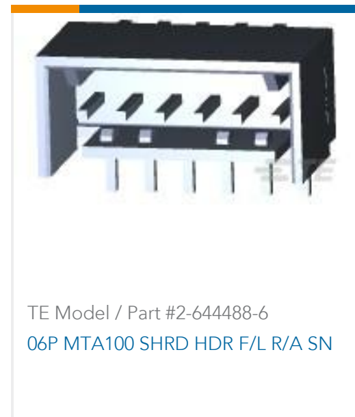
TE Model / Part #2-644488-6 06P MTA100 SHRD HDR F/L R/A SN