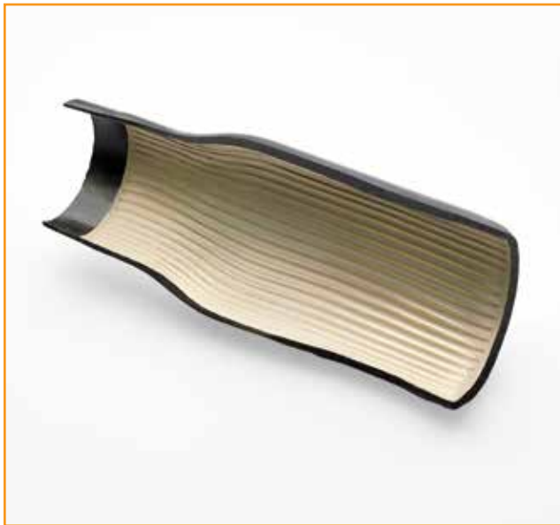
Cross Sectional Area