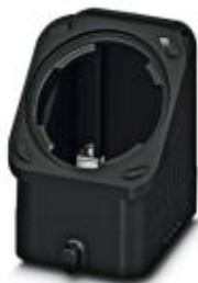
HEAVYCON EVO sleeve housing, plastic, with bayonet flange for EVO screw connection, B6, for single locking latch, height: 60.5 mm, without EVO screw connection

Please be informed that the data shown in this PDF Document is generated from our Online Catalog. Please find the complete data in the user's documentation. Our General Terms of Use for Downloads are valid ( http://phoenixcontact.com/download )