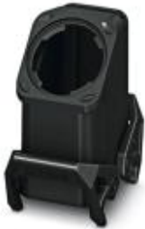
HEAVYCON EVO sleeve housing, plastic, with bayonet flange for EVO screw connection, B10, with double locking latch, height: 87.5 mm, without EVO screw connection

Please be informed that the data shown in this PDF Document is generated from our Online Catalog. Please find the complete data in the user's documentation. Our General Terms of Use for Downloads are valid ( http://phoenixcontact.com/download )