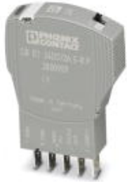
Electronic device circuit breaker, 1-pos., active current limitation, status output and reset input, plug for base element.

Please be informed that the data shown in this PDF Document is generated from our Online Catalog. Please find the complete data in the user's documentation. Our General Terms of Use for Downloads are valid ( http://phoenixcontact.com/download )