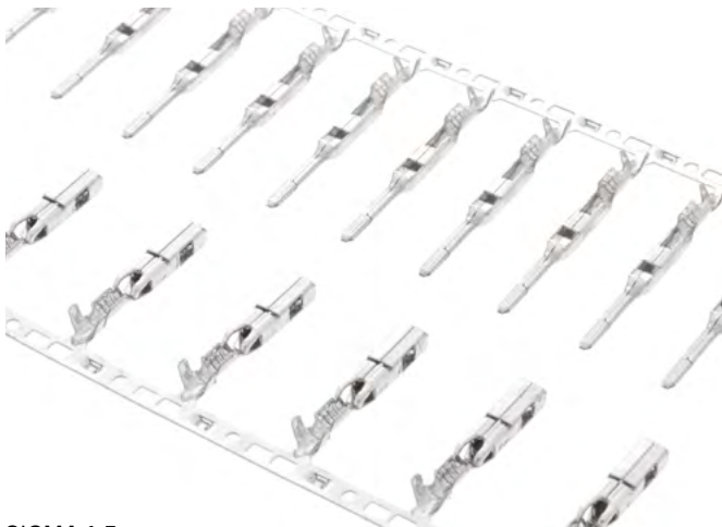
SICMA 1.5 Female & Male Terminals