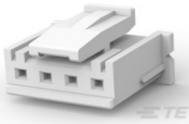
TE Part # 1969442-4 EP 2.5 TPA Housing, 4 Pos