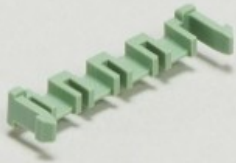
PCB Latches, Locks & Retainers (36)