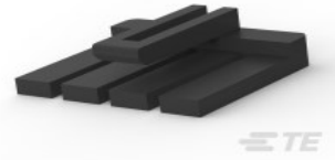
TE Part # 1969443-4 EP 2.5 TPA Retainer, 4 Pos