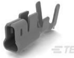
TE Part # 1744423-1 EP 2.5 RCPT CONTACT, 2... AWG