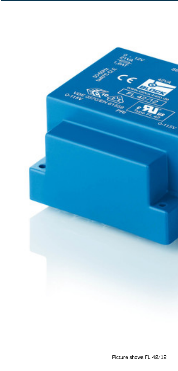
Picture shows FL 42/12