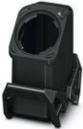
HEAVYCON EVO coupling housing, plastic, with bayonet flange for EVO screw connection, B10, with double locking latch, height: 90 mm, without EVO screw connection

Please be informed that the data shown in this PDF Document is generated from our Online Catalog. Please find the complete data in the user's documentation. Our General Terms of Use for Downloads are valid ( http://phoenixcontact.com/download )