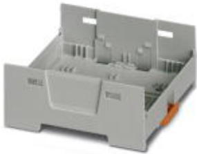
DIN rail housing, Lower housing part with base latch, flat design, width: 70.1 mm, color: light gray (7035)

Please be informed that the data shown in this PDF Document is generated from our Online Catalog. Please find the complete data in the user's documentation. Our General Terms of Use for Downloads are valid ( http://phoenixcontact.com/download )