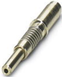
Replacement ferrule set (10 pcs.) for M12 POF fiber optic connector (Order No. 1416606)

Please be informed that the data shown in this PDF Document is generated from our Online Catalog. Please find the complete data in the user's documentation. Our General Terms of Use for Downloads are valid ( http://phoenixcontact.com/download )