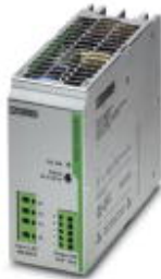
Primary-switched TRIO POWER power supply for DIN rail mounting, input: 3-phase, output: 24 V DC/10 A

Please be informed that the data shown in this PDF Document is generated from our Online Catalog. Please find the complete data in the user's documentation. Our General Terms of Use for Downloads are valid ( http://phoenixcontact.com/download )