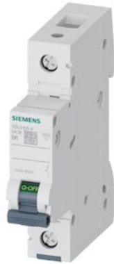
Miniature circuit breaker 230/400 V 6kA, 1-pole, B, 6A